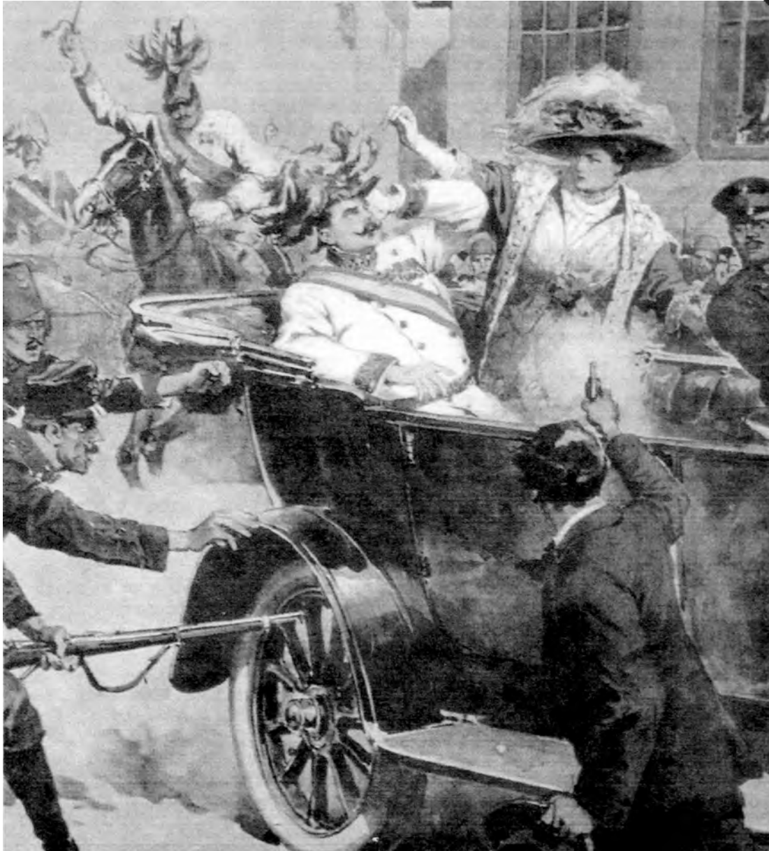
An illustration of the assassination of Franz Ferdinand and his wife in Sarajevo, June 1914.