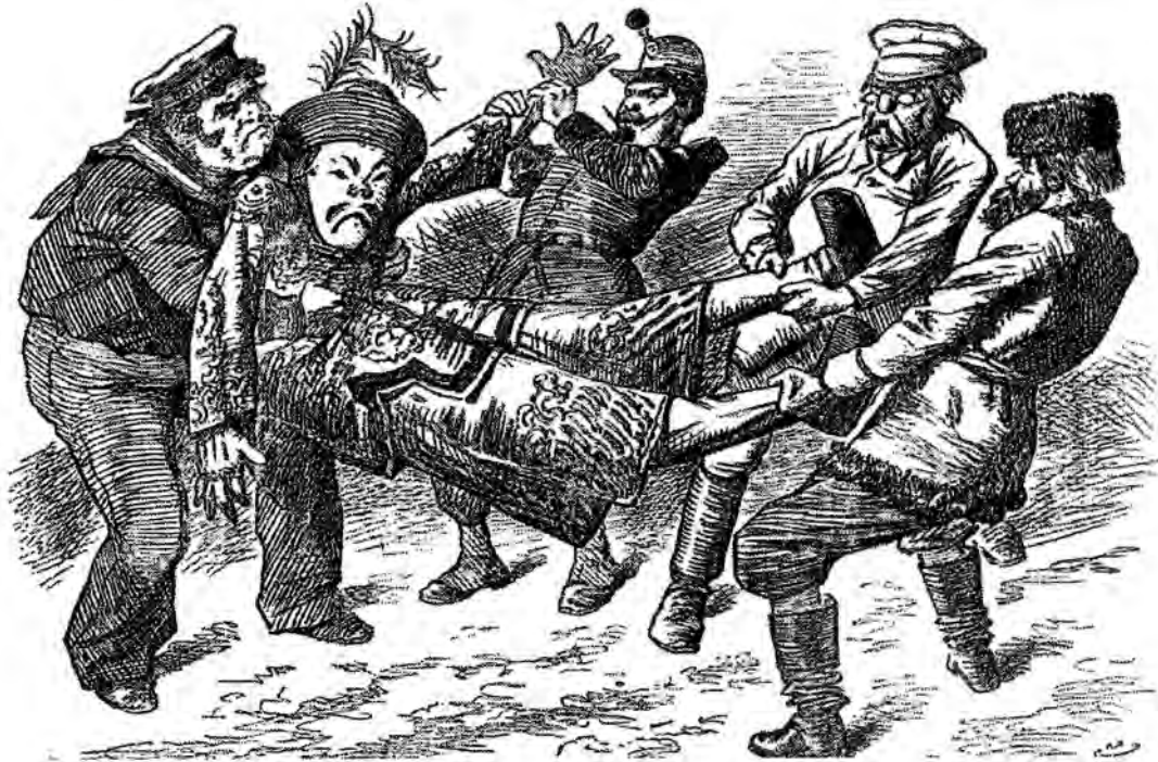
A nineteenth-century cartoon showing China being pulled in different directions by several European countries.

24 Study the cartoon, and then answer the questions which follow.