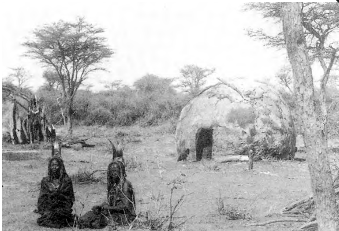
Part of a Herero settlement.

19 Study the picture, and then answer the questions which follow.