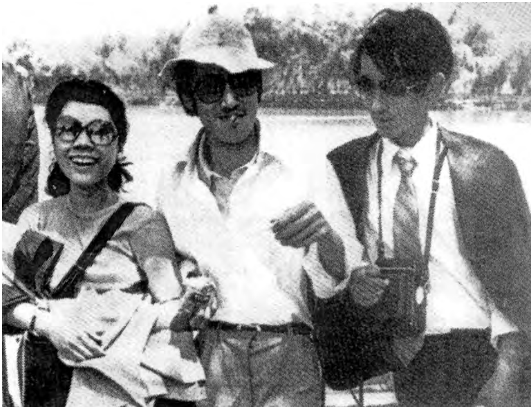
Young Chinese people on the streets of Beijing in the 1980s.

16 Study the photograph, and then answer the questions which follow.