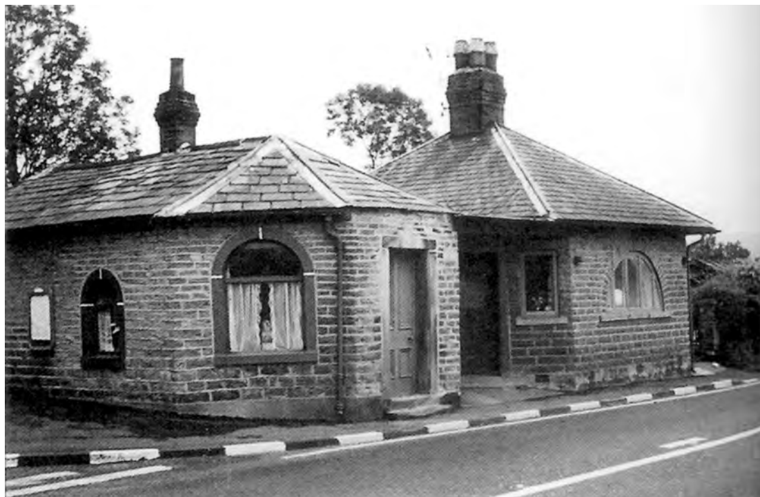
A picture of an eighteenth-century toll-house.

22 Study the photograph, and answer the questions which follow.