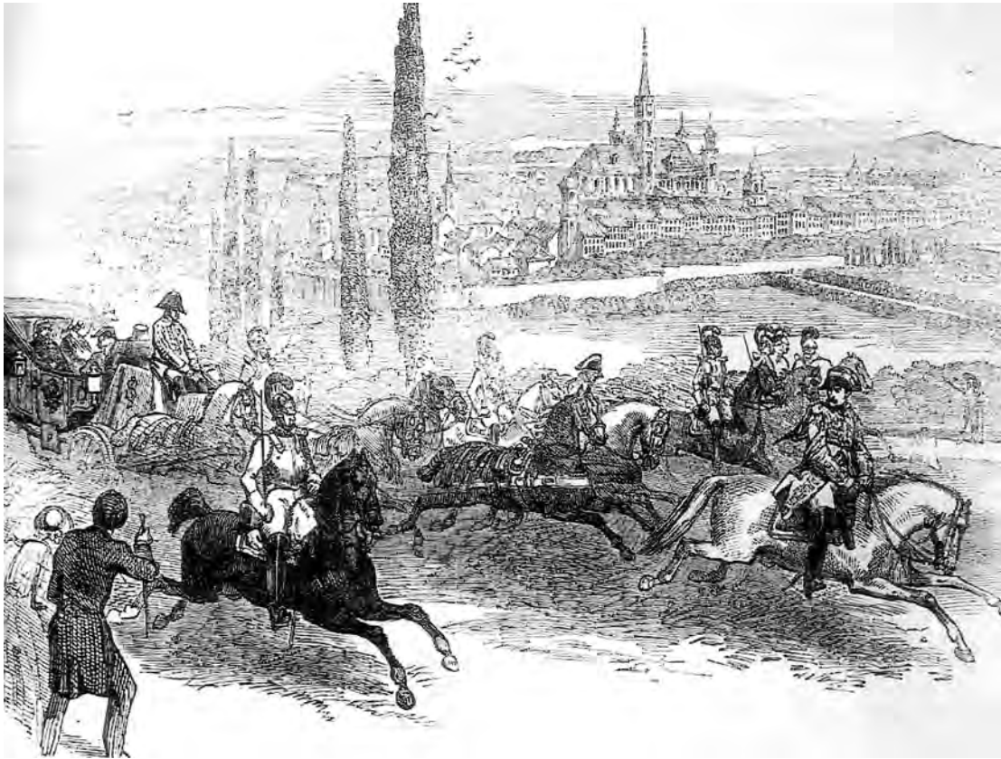
The Emperor of Austria abandoning Vienna and heading to Innsbruck, May 1848.