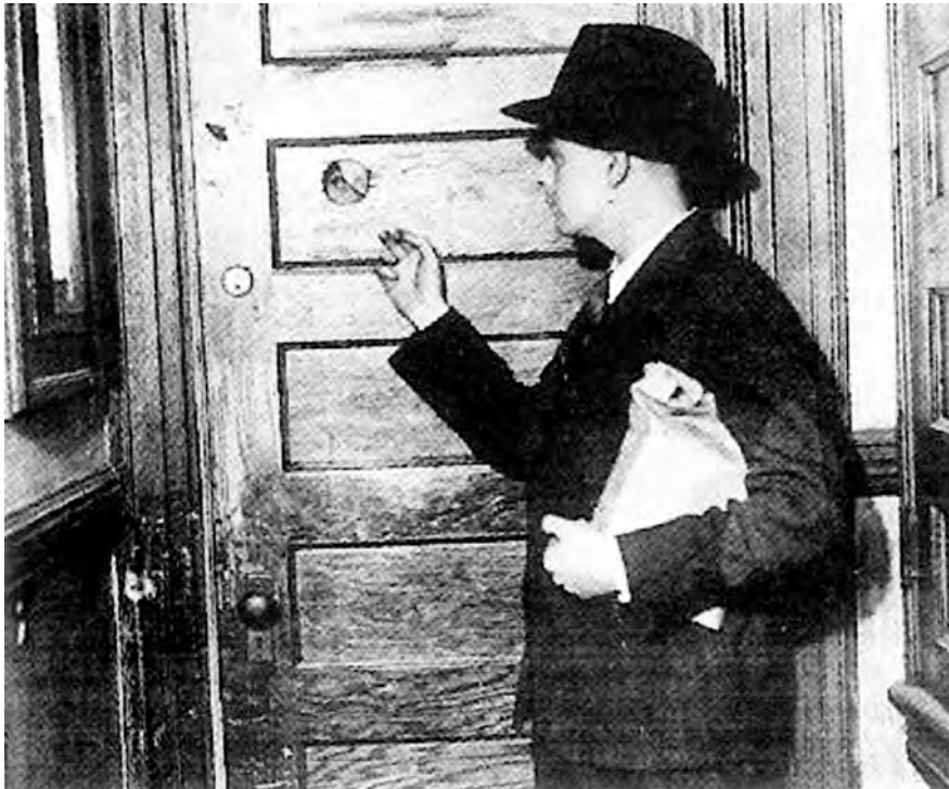
An American visiting a speakeasy.

13 Study the photograph, and then answer the questions which follow.