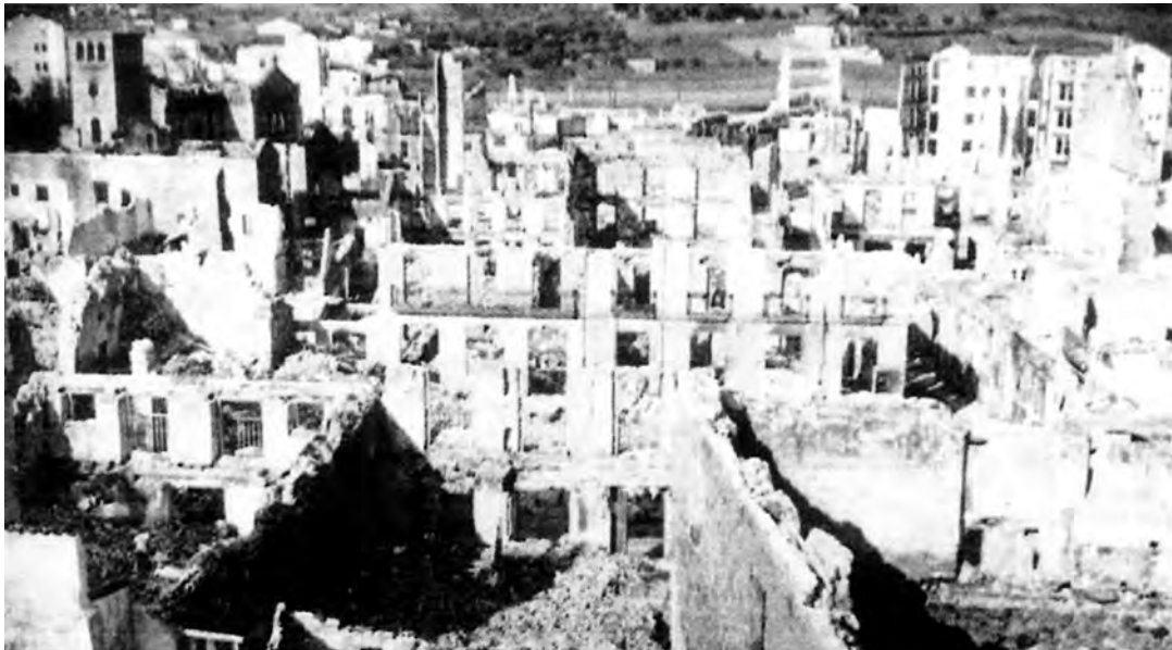
A photograph of Guernica after being attacked by German bombers in 1937.