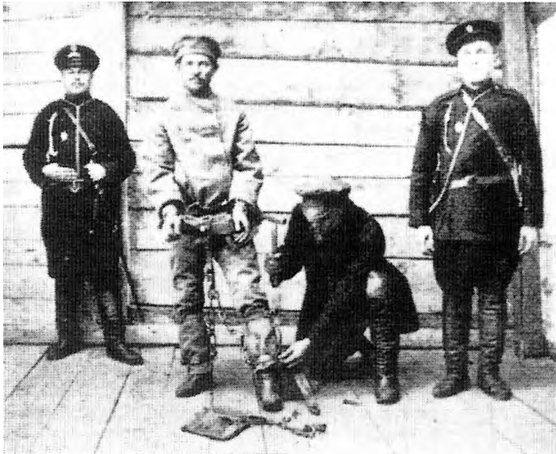
A prisoner of the Okhrana.

11 Study the photograph, and then answer the questions which follow.